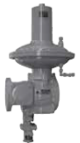
Gas Pressure Regulators