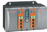
ControlEdge™ HC900 Safety Controller

ControlEdge HC900 is a highly reliable SIL 2 controller based on a proven platform that is easy to configure, with excellent networking and best in class loop control capabilities.