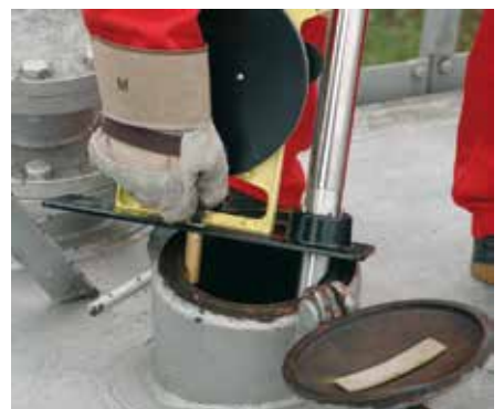
for gauging pipe up to 6 inch diameter