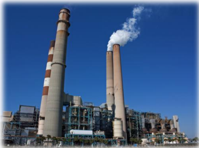
Figure 1. Electrical power producers are faced with a wide range of automation challenges.

A typical power plant has three main operational areas: boilers, turbines and balance-of-plant. Tight integration of these areas is crucial, especially as each has specific control requirements. For example, a boiler requires very precise proportional-integral-derivative (PID) control, whereas in the balance-of-plant area, control depends on the correct handling of discrete inputs/outputs.