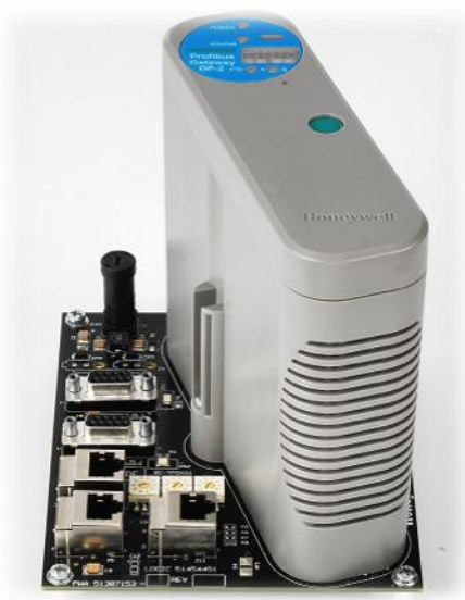
Figure 3. Honeywell's robust Experion C300 controller.

C300 Controller: The Experion C300 controller operates Honeywell's deterministic Control Execution Environment (CEE) software, which executes control strategies on a consistent and predictable schedule.