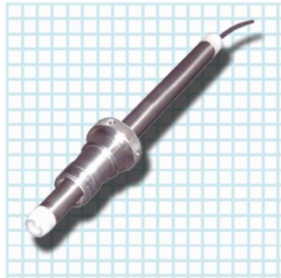
Hand-Tite Fitting and Electrode

The HBD547 pH electrodes are designed to be used with 1" MNPT Wrench-tite or 1-1/4" MNPT Hand-tite compression fittings. These sensors require 1-1/4" or larger full port valve. The insertion depth is user selectable with variable titanium sheath set lengths.