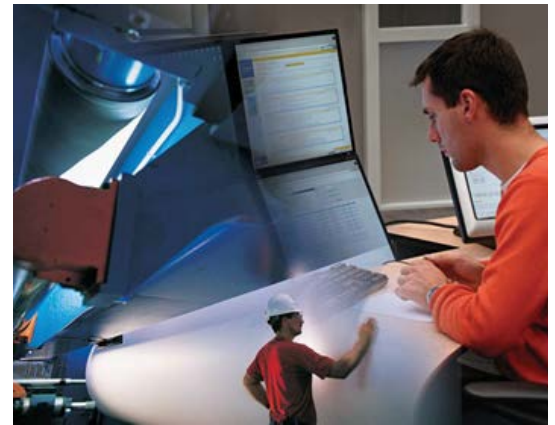
Profitability in each step of order- thro' - invoice

Complying to ISA-95 standards, OptiVision has proven itself in hundreds of installations worldwide.