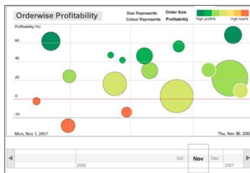
Costing Graphical Displays