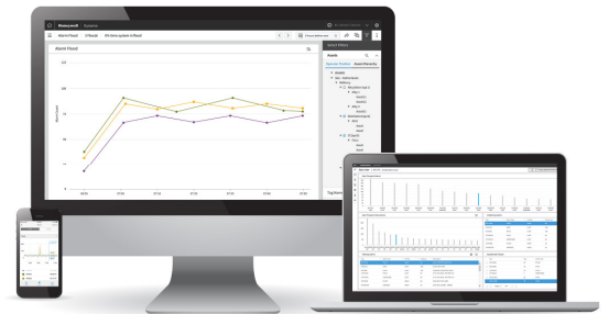
DynAMo Metrics and Reporting for complete situational awareness both inside and outside of the control room. From desktop to cloud.